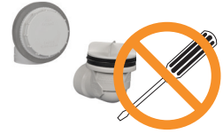
Test Kit Installation